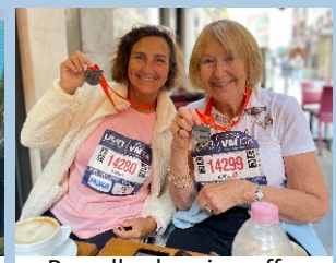
Proudly showing off their medals!