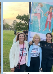
7am at departure.