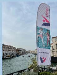
Veerni flag is up on the Venice Grand Canal.