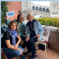
Last meeting before the big day