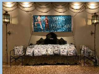
Bibs are ready for collection.